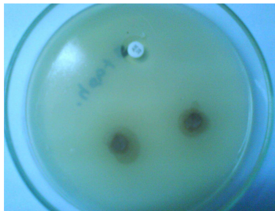
Fig3: Anti fungal activity against Candida albicans