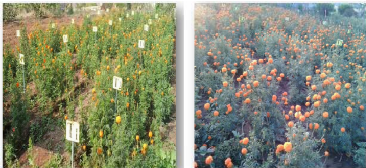
Photo 1. General view of the experiment cv. Pusa Basanti Gaiinda