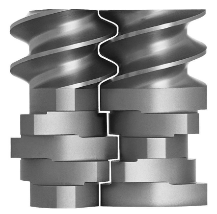
Figure 2 Intermeshing profiles of twin screws

Twin-screw extrusion offers the pharmaceutical formulator a rapid, continuous process that has much better mixing capability than single screw extrusion. Moreover, twin screw extrusion provides a more stable melting process, shorter residence times and significantly greater output. Industrially, twin screw extrusion has become extremely favourable because of process practicality and the ability to combine separate batch operations into a single continuous process, thus increasing manufacturing efficiency. This extruder characterised by short residence time, self wiping screw profile, minimum inventory, versatility, superiority. Typical twin-screw laboratory scale machines have a diameter of 16-18 mm and length of four to ten times the diameter. A typical throughput for this type of equipment is 0.5-5 gm/min. As the residence time in the extruder is rather short and the temperature of all the barrels are independent and can be accurately controlled from low temperatures (30°C) to high temperatures (300°C) degradation by heat can be minimized [20,21]. Typical twin screws have been shown in figure 2.