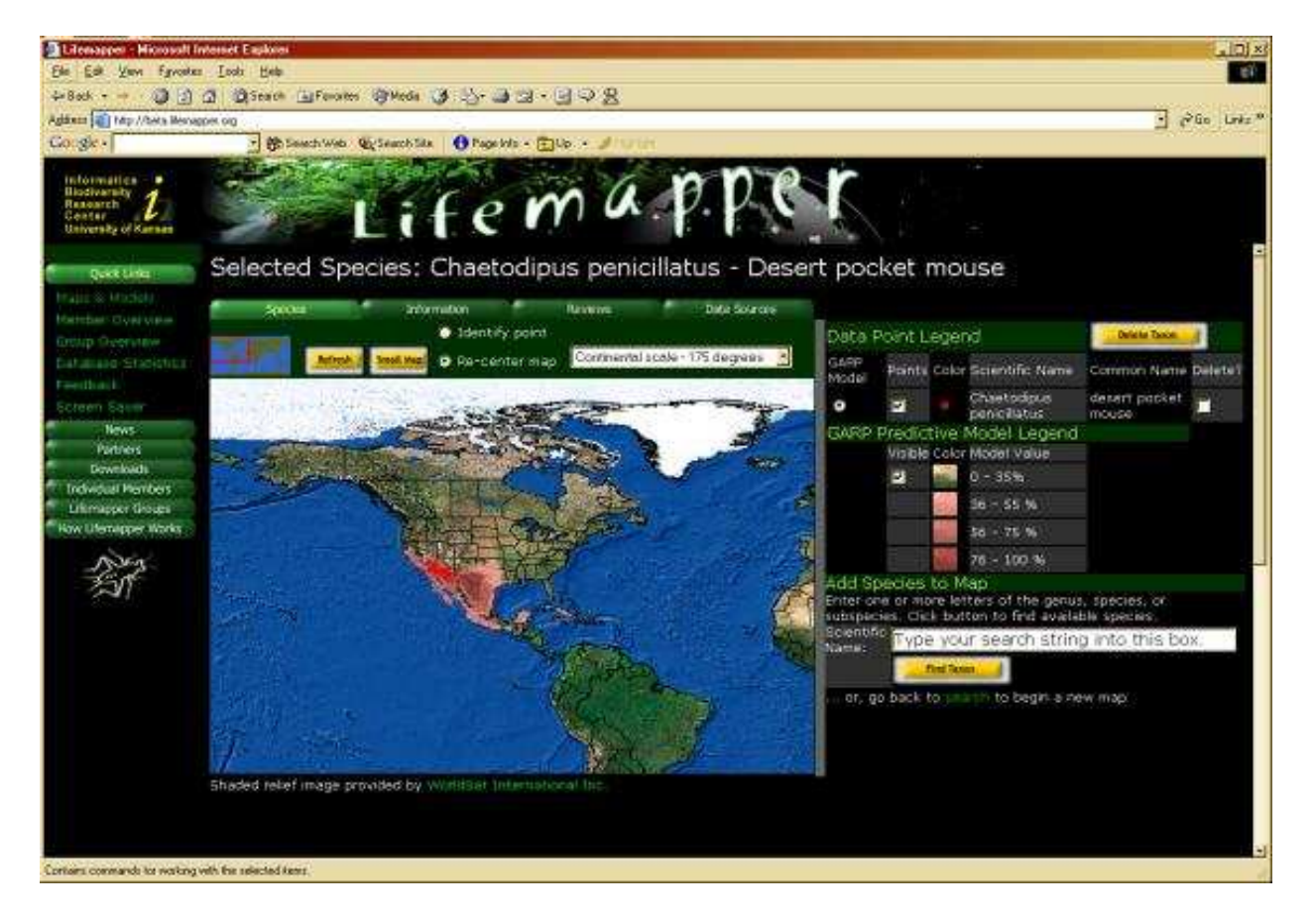
Figure 3. Lifemapper Mapping Application. The Lifemapper map page displays species data points and aggregate distribution models archived archived on the server.

The results of the processing pipeline are graphically displayed on the Lifemapper web site (<u>http://www.lifemapper.org</u>) from the Maps and Models menu. The mapping application was created using the ArcIMS, ArcSDE, ArcIMS Active X Connector and VBScript.