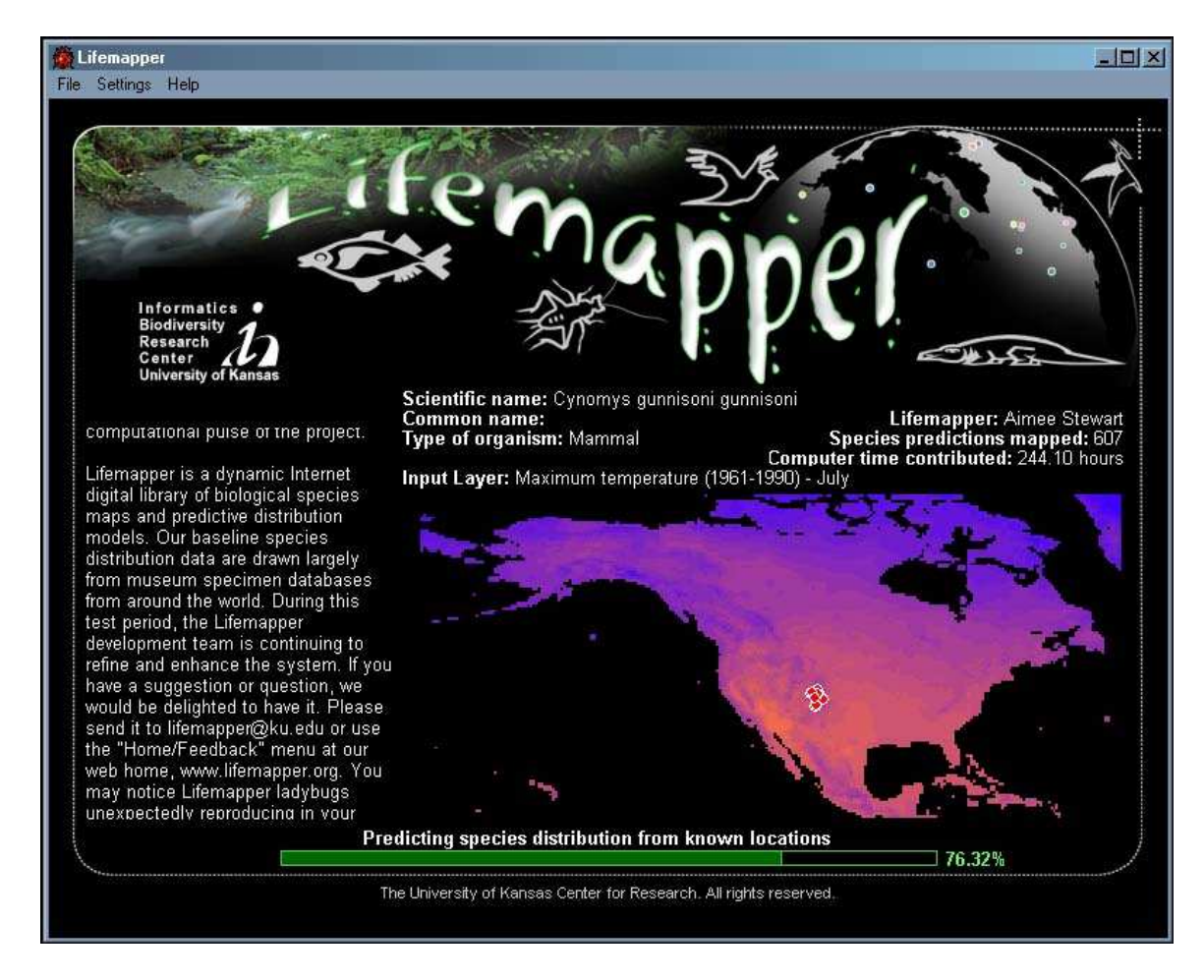
Figure 2. Lifemapper Screen Saver.

The Lifemapper screen saver (Figure 2) implements an evolutionary algorithm called the Genetic Algorithm for Ruleset Prediction(GARP,Stockwell and Peters, 1999). This method has been shown to be the best available method for reliable species predictions using small sets of ad hoc data typically returned from museum databases (Stockwell and Peterson, 2002). The algorithm creates a set of rules to predict presence or absence of a species at a cell, then iteratively tests and modifies them.