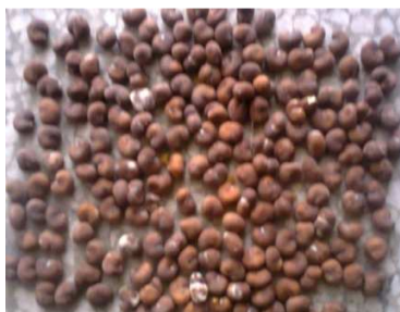
FIGURE 2: A. digitata seeds