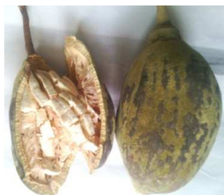
FIGURE 2: A. digitata Fruit