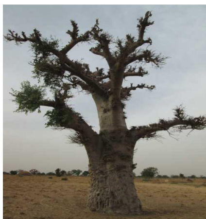
FIGURE 1: A. digitata Tree

The aim of this paper is to determine some nutraceutical properties of Adansonia digitata seeds such as proximate analysis, elemental analysis as well as physicochemical characterization and anti oxidant capacity of the seed oil.