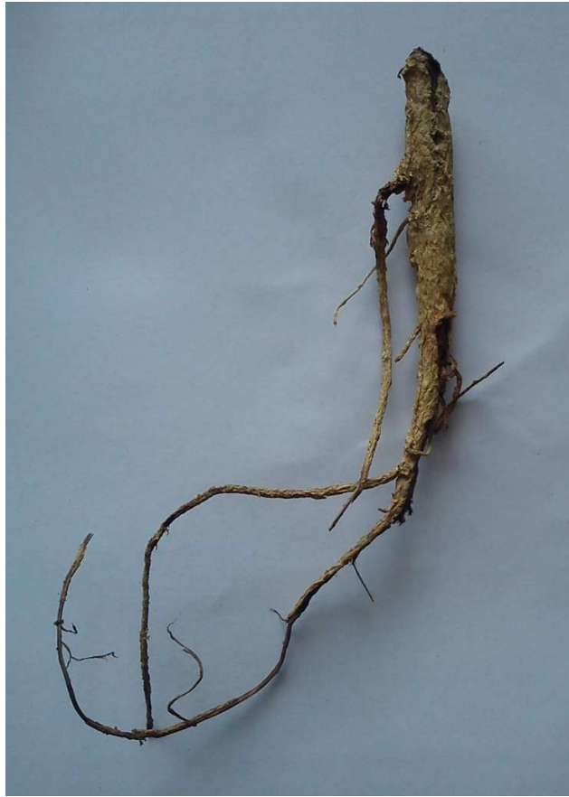
Figure 1: Jatropha integerrima Jacq. root