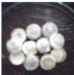
Figure 1. Formulated ocuserts