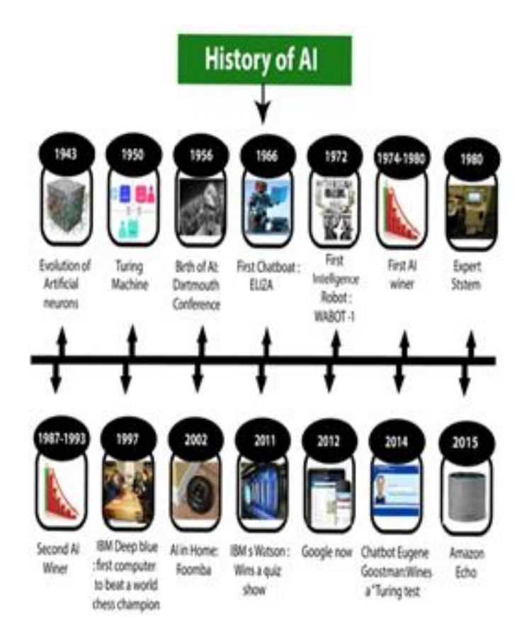
Figure 1: History of AI.