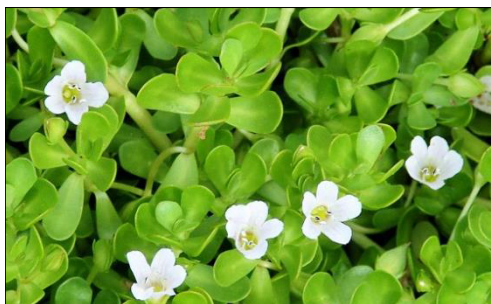
Figure 1: Bacopa monnieri

Bacopa monnieri has been used in Ayurvedic system of medicine from centuries and classified under medhyarasayana , i.e., medicinal plants which rejuvenate memory and intellect (Figure 1). It has been used by Ayurveda in India for almost 3000 years [1]. It is a small perennial creeping herb which belongs to 'Scrophulariaceae' family that has 220 genera and 4500 species. According to National Medicinal Plants Board (NMPB) it is also known as Herpestis monniera (L.), Gratiola monniera (L.), Moniera cuneifolia , Moniera cuneate locally known as brahmi , water hyssop, pan brahmi, jalbuti, jalmim, etc. The name Brahmi is derived from the word 'Bramai' the mythical "creator" in the Hindu pantheon. Genus Bacopa includes more than 100 species of aquatic herbs. It is found in India, Nepal, Srilanka, Vietnam, China, Taiwan, Hawaii, Florida and some other Southern states of USA where it grows in wetland and muddy shores.